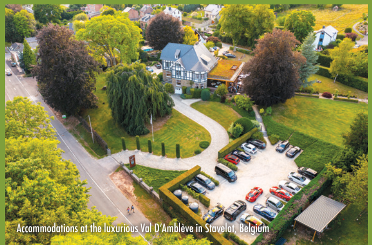
Accommodations at the luxurious Val D'Ambève in Stavelot, Belgium