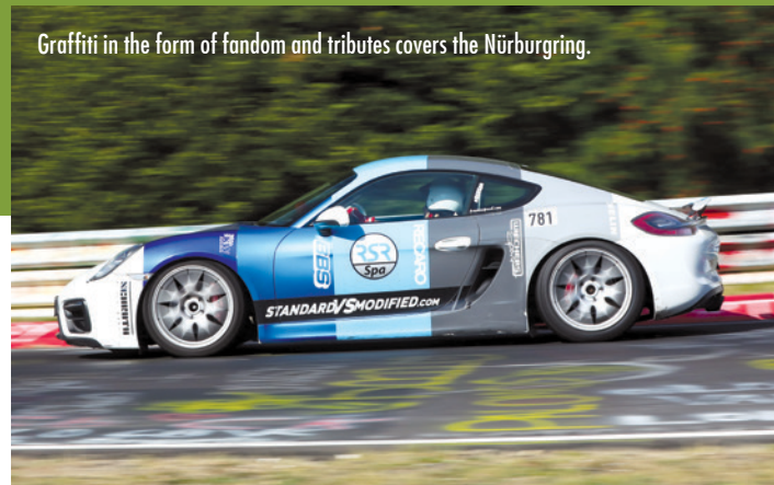
Graffiti in the form of fandom and tributes covers the Nürburgring.

spearheaded by Ron Simons, that can outfit you with a sports car from an incredible selection, including Porsches like the newest GT4 RS, GT3, and 718 GTs. These three “Ring Meisters” (Tom, Ross, and Ron) provided targeted driving coaching, corner-by-corner analysis of the entire track, and mindset framing to prepare all 25 participants to excel at Nürburgring Nordschleife and Spa-Francorchamps. As if driving these illustrious tracks, and with such accomplished mentors, weren’t enough, the Speed Secrets trip also included luxury accommodations, incredible meals and wines, and networking opportunities with other amazing guests.