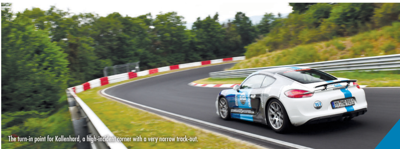
The turn-in point for Kallenhard, a high-inclined corner with a very narrow track-out.

Bringing people together, fostering community, this too was at the heart of the Speed Secrets trip, and it is also true for anyone traveling to the Nürburgring. Even on tourist days, the sense of community surrounding the track is palpable, and you feel that this is your extraordinary, new track-away-from-home. It's important to note that because it's not easy, you feel a deep connection to everyone and anyone who has made the pilgrimage. Surrounded and uplifted by both amateur and professional drivers of the Nürburgring, it's a track that is brave and beautiful, and its power will move you in a most magical way. 🏁