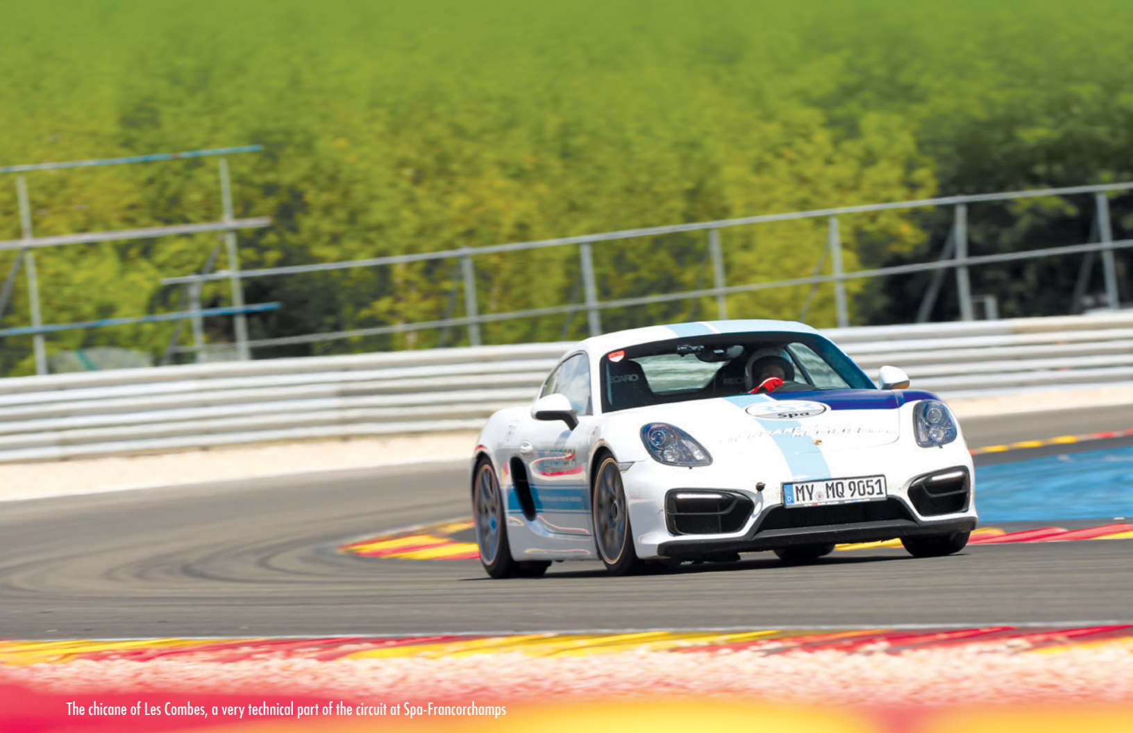
The chicane of Les Combes, a very technical part of the circuit at Spa-Francorchamps

Story by Auste Viesulas