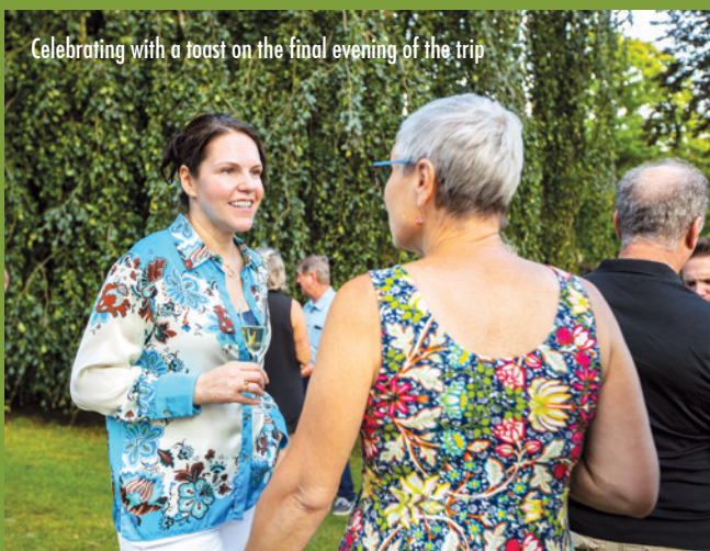
Celebrating with a toast on the final evening of the trip

My best recorded full lap time was 9:20. Sadly, very sadly, my last six lap times went uncaptured due to a glitch in the software, but I know in my heart that I went even faster. There will have to be a next time!