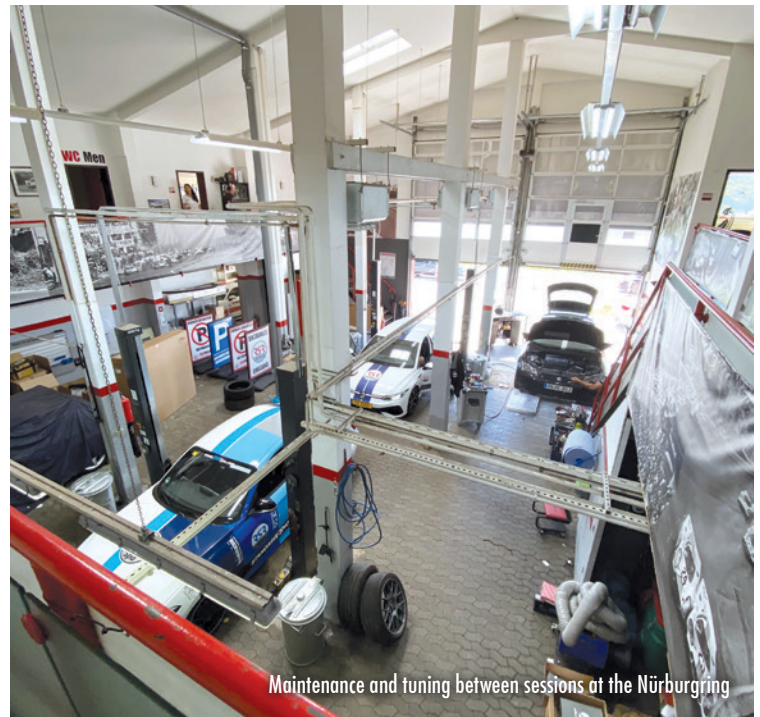
Maintenance and tuning between sessions at the Nürburgring