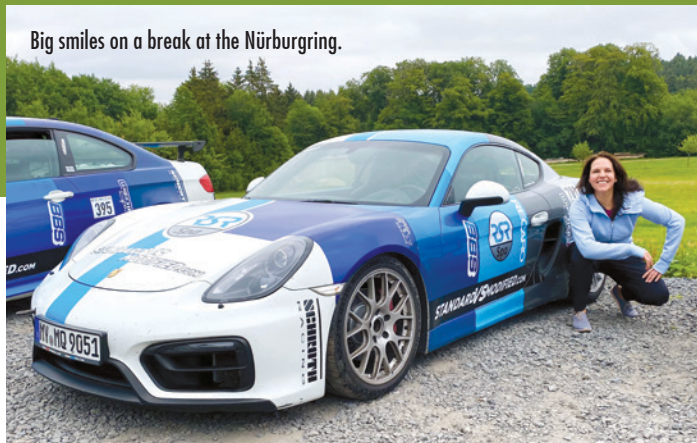
Big smiles on a break at the Nürburgring.