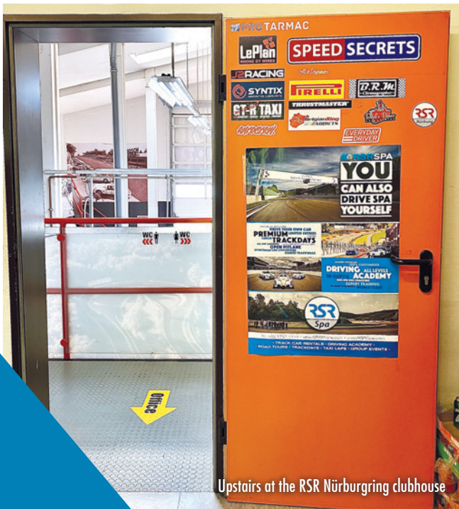
Upstairs at the RSR Nürburgring clubhouse

So, if you choose the Speed Secrets trip or decide to organize your own journey, you’ll want to drive the Nürburgring on a private track day for experienced drivers. RSR Nürburgring or a few other high-performance liveries can hook you up directly with