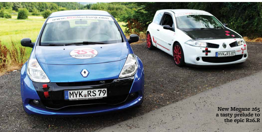
New Megane 265 a tasty prelude to the epic R26.R