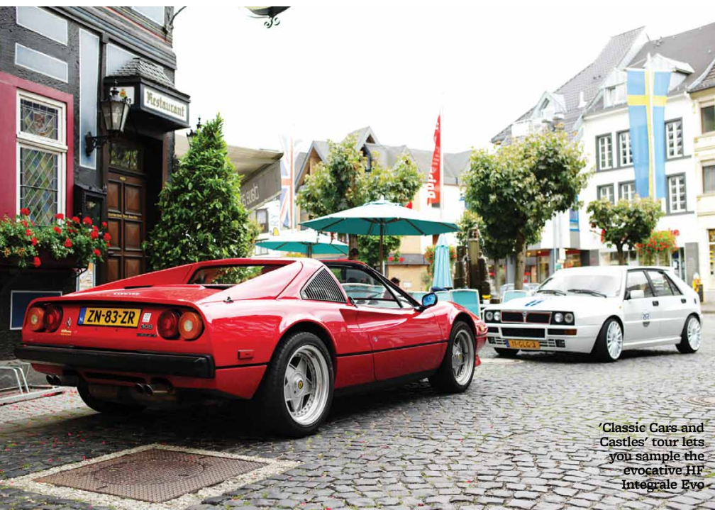
'Classic Cars and Castles' tour lets you sample the evocative HF Integrale Evo