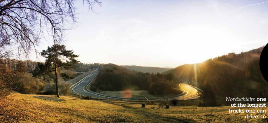
Nordschleife one of the longest tracks one can drive on